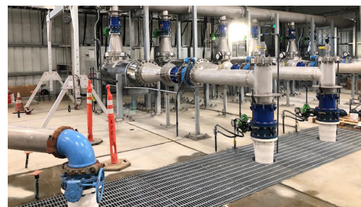
Expansion slot for UV treatment equipment