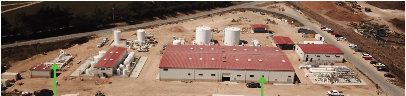
Product Water Pumps