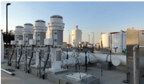
Expansion slot for product water pump