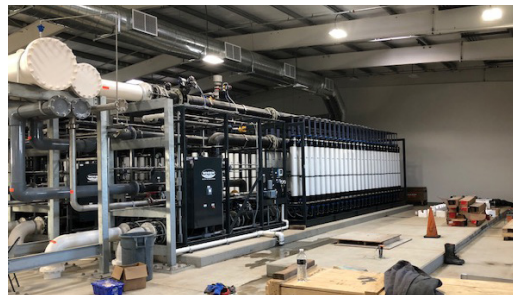
Expansion slot for membrane filtration treatment skid