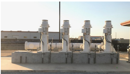
Expansion slot for source water pump