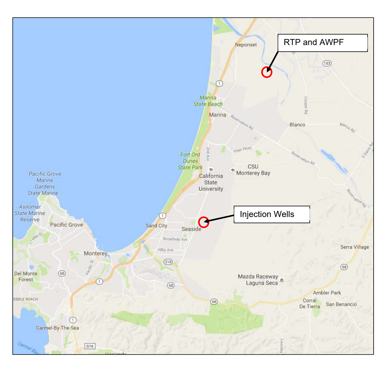
Figure 1 - Location of MRWPCA's RTP, AWPF and Injection Wells